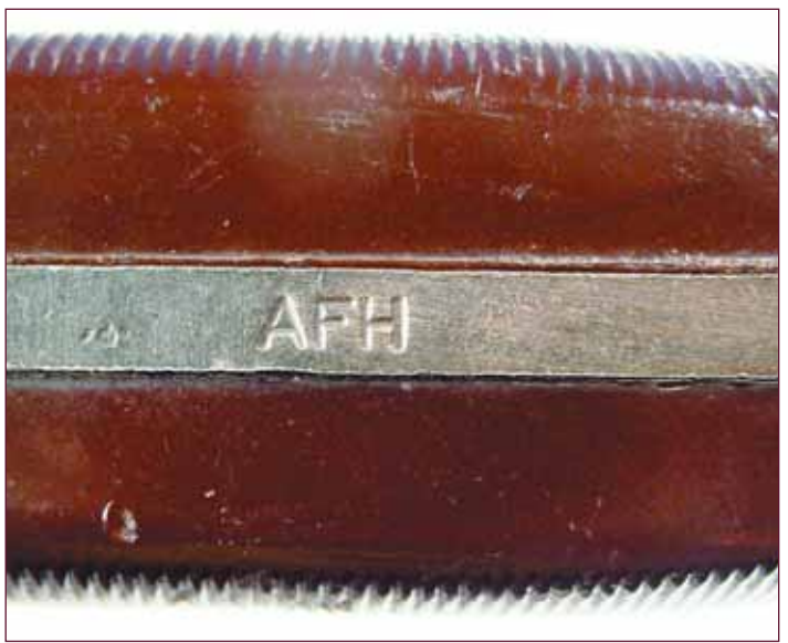
1943 AFH M1905 converted to M1 by AFH.