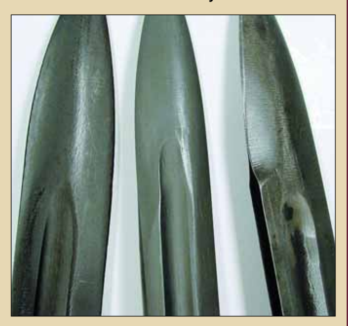
Transitional UFH M1s with standard fuller (left), and long irregular fuller (center); PAL M1 with hand-ground fuller (right).

An interesting sub-field of bayonet collecting is identifying early M1 bayonets produced in the transition from M1905 production. The earliest M1 bayonets were marked with the 1943 date of production, similar to M1905 bayonets. The vast majority of M1 bayonets, however, were not marked with the year of production. Additionally, collectors have identified M1 bayonets with irregularly shaped fuller grooves at the point end. Sometimes these show hand grinding marks, and sometimes there are irregular dimensions that some collectors hypothesize resulted from partially finished 16" blades being re-forged to the new 10" length. There is still a lot of work to be done in this field.