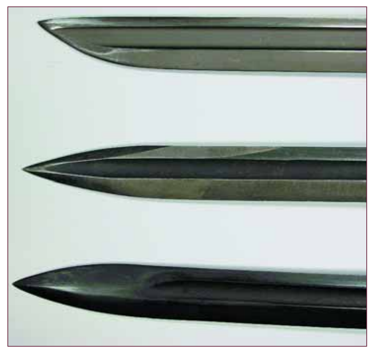
Converted point types: knife (top), spear (center), original M1 (right).

With the decision to adopt the M1 bayonet, Ordnance developed a program to convert the older 16" M1905 bayonets to the new 10" standard. Springfield Armory and the five civilian manufacturers converted M1905 bayonets returned from stateside and overseas units. The 16" blades were cut down and the points reground. The point was usually a "spear" style like the original bayonet, but a "knife" style was occasionally used. The knife point was an attempt to compensate for the thin, fragile steel left in the deep, square fuller of early production M1905's.