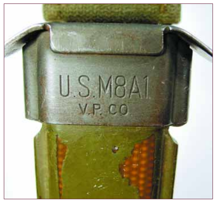
1950's production M8A1 by Victory Plastics.

The M5 series of bayonets was issued with the M8A1 scabbard originally designed for the M3 trench knife and M4 bayonet. This scabbard was produced from 1944 until the 1980s and also used for the M14's M6 bayonet and the M16's M7 bayonet. During WWII, Beckwith Manufacturing (B.M. CO.) produced over 3 million M8A1's and its subsidiary, Victory Plastics (V.P.