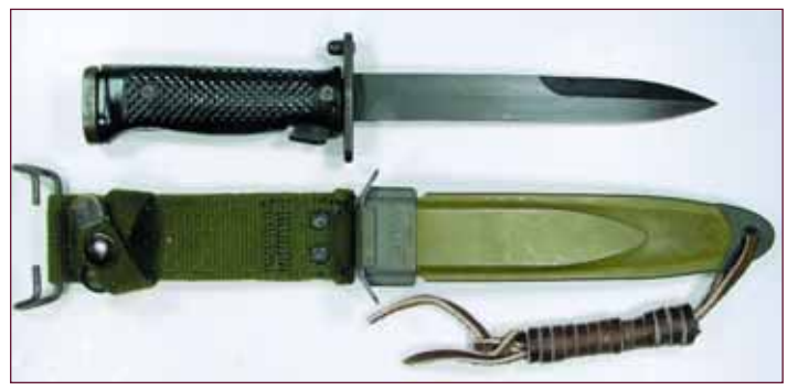
M5A1 bayonet with late, long throat M8A1 scabbard.