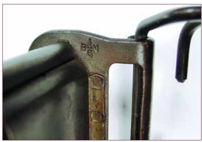
Beckwith scabbard mark.