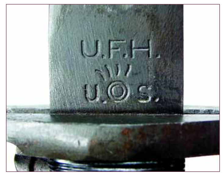
Typical makers mark on M1 bayonets.

The M7 scabbard, essentially a shorter version of the M3, was adopted for the M1 bayonet. Beckwith Manufacturing Co. produced 2,112,672 from April 1943 to August 1945. Detroit Gasket & Mfg. Co. did not produce M7's.