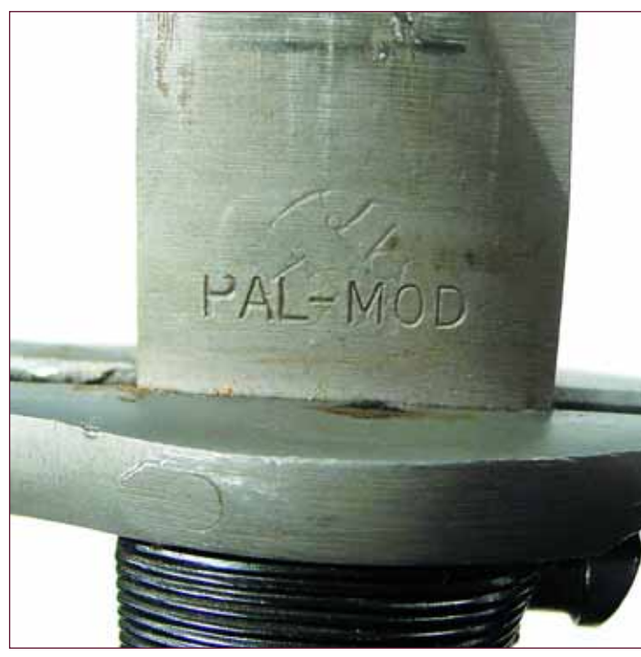
1942 Utica M1905 converted to M1 by Pal.

Most "cut down" bayonets were marked by the company that did the modification, and no special effort was made to segregate the bayonets by original manufacturer. Any manufacturer's M1905 bayonet, including Rock Island or Springfield, could be converted by any other manufacturer. Frequently, the company doing the modification marked the bayonet. A total of 1,007,671 M1905 bayonets were converted to M1's during WWII. Ordnance made no distinction in basis of issue or nomenclature between an original production M1 bayonet and one converted from a M1905.