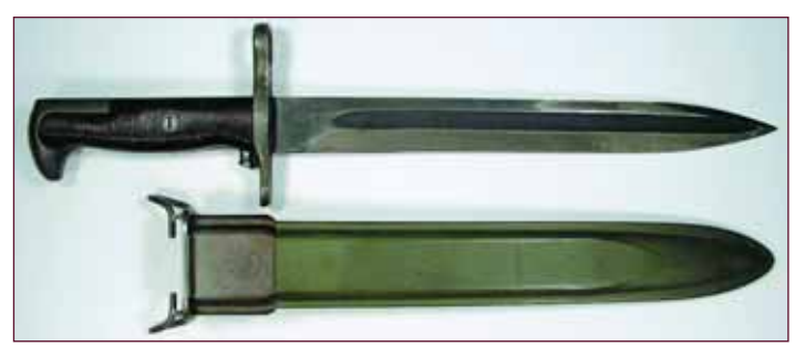
M1 Converted bayonet with M7 Converted scabbard.

Similar to the conversion of M1905 to M1 bayonets, there was a wartime program to shorten M3 scabbards to M7 length. The scabbards were disassembled, the body shortened and the metal throat reattached. These converted scabbards can be identified by the different style of crimp attachment where the body joins the throat. There were 1,846,768 M3 scabbards converted to M7's in WWII, and Ordnance made no distinction in nomenclature between original and converted scabbards.