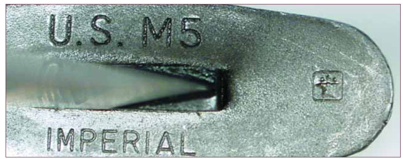
Imperial M5 maker mark and Defense Acceptance Stamp.