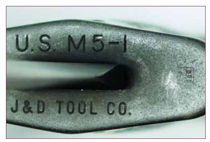
J&D Tool M5A1 markings.