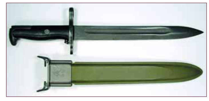
M1 bayonet with M7 scabbard.

In order to produce a more practical weapon and conserve steel, a new bayonet was adopted in 1943. The M1 bayonet was basically a shorter M1905 with a 10" rather than 16" blade. Five of the original six civilian manufacturers producing M1905 bayonets converted to M1 bayonet production. Wilde Drop Forge & Tool Co. discontinued its production. From April 1943 through August 1945, some 2,948,649 M1 bayonets were produced.