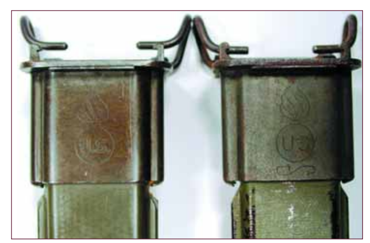
M3 scabbard markings: Beckwith Mfg, (Left) Detroit Gasket (Right).

The M3 was the most widely issued scabbard for the M1905 bayonet during WWII, but period photographs show the M1910 scabbards continued to see service throughout the war. Even the substitute standard scabbards like the M1917 were widely used in stateside training and early combat in the Pacific and North Africa.