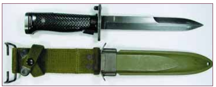
M5 with early M8A1 scabbard.

This kitchen cutlery manufacturer had substantial quality control problems early on, but overcame them to produce 210,000 M1905 and 340,000 M1 bayonets from 1942 to 1944.