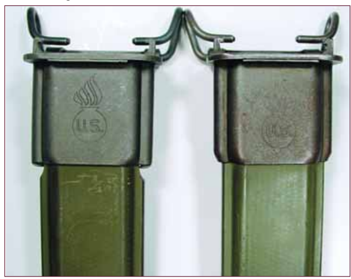
M7 (left) and converted M7 (right). Note the configuration of the metal where it joins the body.

Similar to the conversion of M1905 to M1 bayonets, there was a wartime program to shorten M3 scabbards to M7 length. The scabbards were disassembled, the body shortened and the metal throat reattached. These converted scabbards can be identified by the different style of crimp attachment where the body joins the throat. There were 1,846,768 M3 scabbards converted to M7's in WWII, and Ordnance made no distinction in nomenclature between original and converted scabbards.